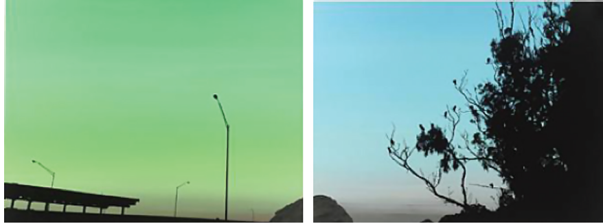
Figure 3. Glenn Rubsamen, I've decided to say nothing (2006). Acrylic on linen, diptych.

kind of postmodern in-between (a neither–nor). Indeed, both metamodernism and the postmodern turn to pluralism, irony, and deconstruction in order to counter a modernist fanaticism. However, in metamodernism this pluralism and irony are utilized to counter the modern aspiration, while in postmodernism they are employed to cancel it out. That is to say, metamodern irony is intrinsically bound to desire, whereas postmodern irony is inherently tied to apathy. Consequently, the metamodern art work (or rather, at least as the metamodern art work has so far expressed itself by means of neoromanticism) redirects the modern piece by drawing attention to what it cannot present in its language, what it cannot signify in its own terms (that what is often called the sublime, the uncanny, the ethereal, the mysterious, and so forth). The postmodern work deconstructs it by pointing exactly to what it presents, by exposing precisely what it signifies.