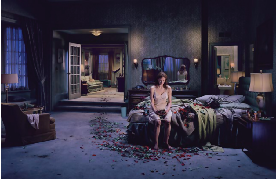
Figure 4. Gregory Crewdson, Untitled (2004). Photograph.

because architecture cannot but be concrete. The works of “starchitects” Herzog and De Meuron are exemplary here. Their more recent designs express a metamodern attitude in and through a style that can only be called neoromantic. A few brief descriptions suffice, here, to get a hint of their look and feel. The exterior of the De Young Museum (San Francisco, 2005) is clad in copper plates that will slowly turn green as a result of oxidization; the interior of the Walker Art Center (Minneapolis, 2005) holds such natural elements as chandeliers of rock and crystal; and the façade of the Caixa Forum (Madrid, 2008) appears to be partly rusting and partly overtaken by vegetation. While the above examples are appropriations or expansions of existing sites, their recent designs for whole new structures are even more telling. The library of the Brandenburg Technical University (Cottbus, 2004) is a gothic castle with a translucent façade overlain with white lettering; the Chinese national stadium (Beijing, 2008) looks like a “dark and enchanted forest” from up close and like a giant bird’s nest from a far 38 ; the residential skyscraper at 560 Leonard street (NYC, under construction) is reminiscent of an eroded rock; the Miami Art Museum (Florida, under construction) contains Babylonian hanging gardens; the Elbe Philharmonic Hall (Hamburg, under construction, see Figure 5) seems to be a