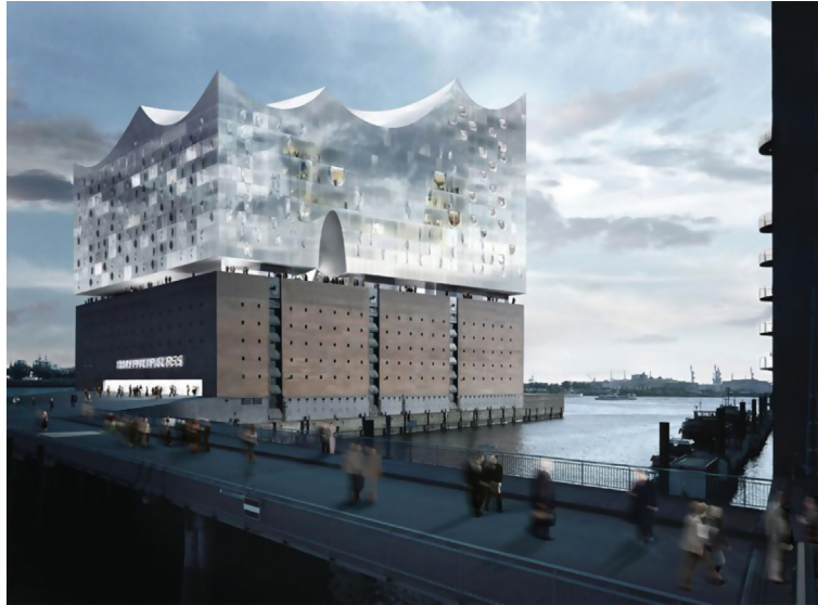
Figure 5. Herzog & de Meuron, Elbe Philharmonie. Copyright Herzog & de Meuron.

bind of both/neither—expose a tension that cannot be described in terms of the modern or the postmodern, but must be conceived of as metamodernism expressed by means of a neoromanticism. 39 If these artists look back at the Romantic it is neither because they simply want to laugh at it (parody) nor because they wish to cry for it (nostalgia). They look back instead in order to perceive anew a future that was lost from sight. Metamodern neoromanticism should not merely be understood as re-appropriation; it should be interpreted as re-signification: it is the re-signification of “the commonplace with significance, the ordinary with mystery, the familiar with the seamliness of the unfamiliar, and the finite with the semblance of the infinite”. Indeed, it should be interpreted as Novalis , as the opening up of new lands in situ of the old one.